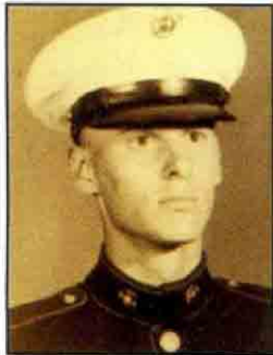
Recruit photo, 1968.